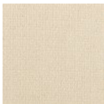
Body Fabric: 2490-34CC