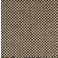
Body Fabric: 2657- 80CC