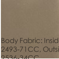
Body Fabric: Inside 2493-71 CC, Outside 2536-34 CC