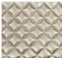
Leather Base: 9085-75CC-Q