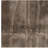
Body Fabric: 8501- 82CC