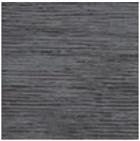
1-19''' x 19''' Pillow 2969-87CC-P