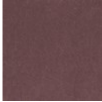
Body Fabric: 2681- 21CC, Contrast Welt 2680-18CC