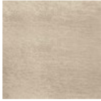
Soft Silver Leaf