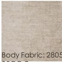
Body Fabric: 2805- 35CC-P Performance