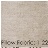
Pillow Fabric: 1-22''' x 18''' Pillow 2805- 35CC-P Performance